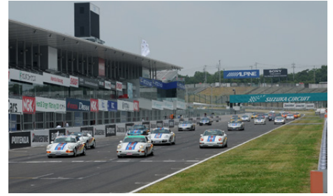
2010: At the Porsche Parade Japan each team has its own styling for the cars

Porsche extends the top of its Carrera model range and adds a pair of all-wheel-drive twins to the two 911 Carrera GTS models. Following the GT3 R Hybrid, 918 Spyder and 918 RSR , the Boxster E represents another sports car concept that combines research and driving enjoyment in quintessential Porsche fashion. The Panamera GTS is showcased in Los Angeles, followed in December by the cabriolet versions of the new 911 (991).