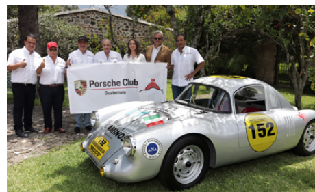
2002: Founded 2002, Porsche Club Guatemala in 2022

The first four-door: The sporty Porsche Cayenne crossover SUV is presented to the international audience at the 2002 Paris Auto Show. The vehicle, also available in Cayenne S and Cayenne Turbo models, is produced in the Leipzig plant.