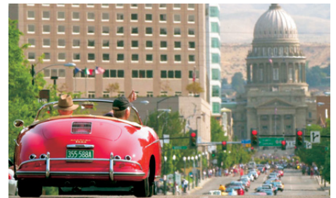
2004: Porsche Parade USA