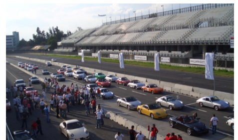
2005: The Porsche Mexico Parade in 2008