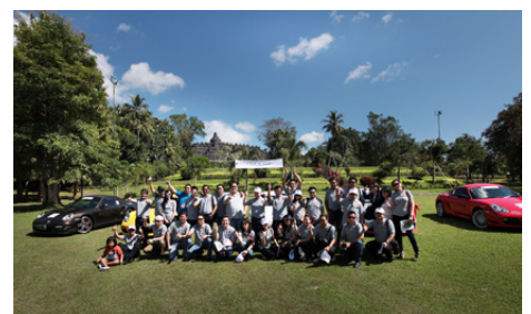
2005: Porsche Club Indonesia