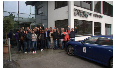
2003: Porsche Club Lithuania in Zell am See

With the RS Spyder , the first Porsche developed exclusively for racing since the 1998 Le Mans winner, the 911 GT1, Porsche returns to the world of prototype sports in 2005.