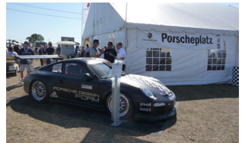
2005: welcoming Club members from around the world: the Porscheplatz events