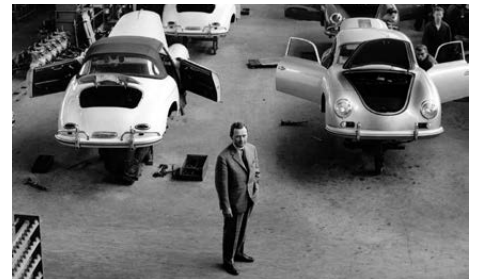
2009: Ferry Porsche would have turned 100