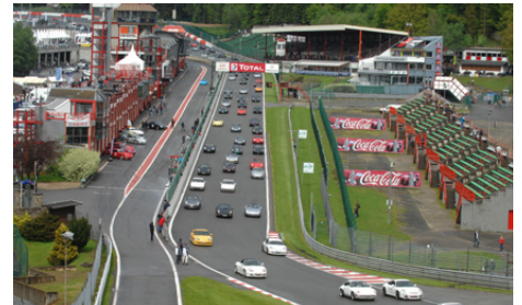
2009: A season opening for all Clubs, the Porsche Club Frankreich Days in April