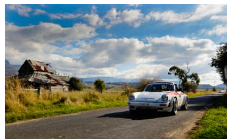
2002: Targa Tasmania 2011 Röhl/Geistdörfer on a 911 SC