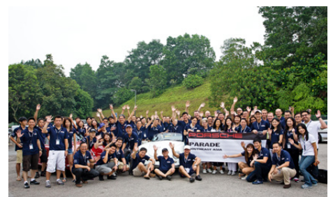
2011: Porsche Parade South East Asia