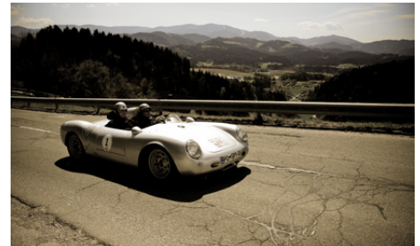
2007: The Cross Border Rallye of the Porsche Klub Slovenija