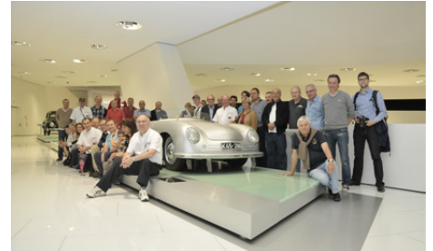
2008: 60 years of the 356 Roadster No.1 here surrounded by Clubmembers from Club Porsche Romand