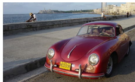
2002: Founding of Porsche Club Cuba