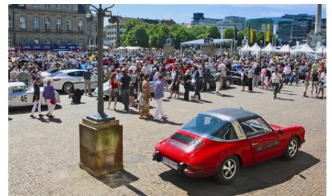
2011: 125 years anniversary of the automobile in Stuttgart