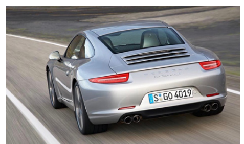
2011: Porsche 911 Carrera type 991