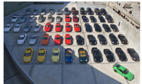
2008: Impressive Season Opening of Porsche Club Estonia