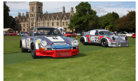
2011: 50 years of Porsche Club Great Britain