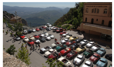
2007: The 356 INT Meeting was held in Spain