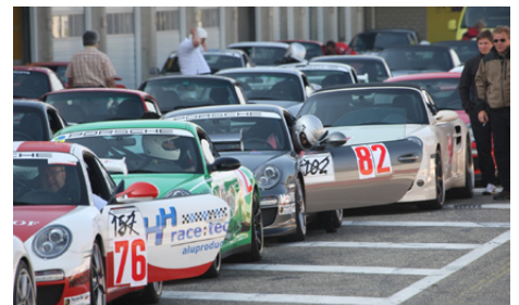
2005: Gentlemen start your engines: Sport Cup Deutschland