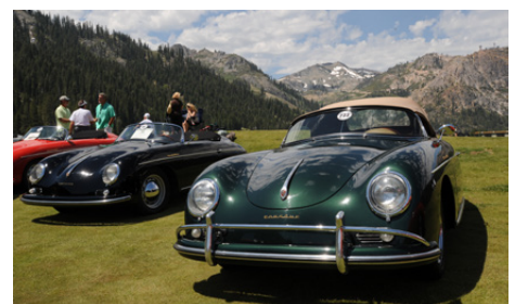
2008: West Coast Holiday of the 356 Registry in 2008