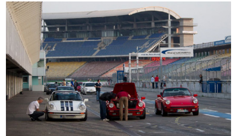
2011: Sporty Club, the Porsche Club für den klassischen 911 Südwest