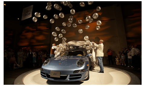
2005: PCA celebrated 50 years with the Porsche Club Coupe

The new cabriolet version of the new Porsche 911 (997) is presented in Detroit. With the Porsche Cayman S , Porsche unveils a mid-engined sports car with big ambitions at the Frankfurt Motor Show. Porsche announces the development of a fourth model series entitled "Panamera" .