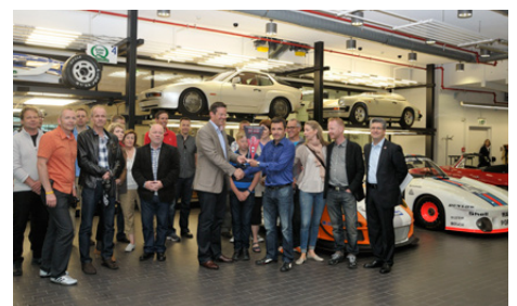
2006: Porsche Club Iceland on factory tour in 2012