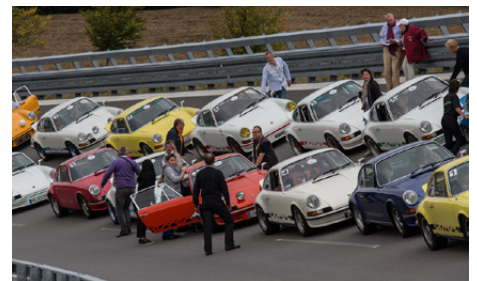
2005: The international Carrera RS Meeting in 2012