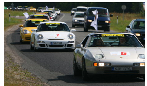
2008: Porsche Track Day in Finland with the Racing Club Finland