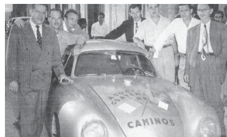
Team Guatemala at the Carrera Panamericana race in 1953