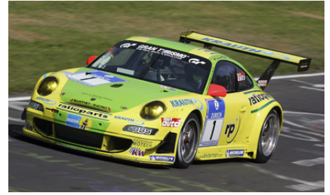
2008: Porsche GT3 RSR

Summer, sunshine, 36 degrees and gleaming museum pieces – the ideal conditions for a successful birthday party. With 41 vehicles, Porsche took part in the exciting procession to celebrate 125 years of the automobile . The mobile birthday party entertained an estimated 250,000 visitors in Stuttgart in an atmosphere reaching fever pitch.