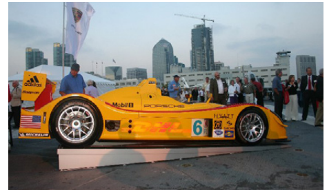
2005: Back into racing: the RS Spyder at Porsche Parade USA