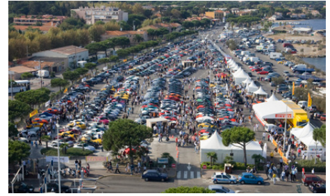
2007: Indeed a paradise: Porsche Paradis St. Tropez

When Dr. Ferdinand Anton Ernst "Ferry" Porsche died on 27 March 1998, the world lost one of the last great automotive entrepreneurs. In September 2009, Ferry Porsche would have turned 100. Over all the years, he always nurtured a vision of a four-seater Porsche. During 2009, this vision is fulfilled.