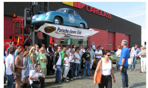
2008: Porsche Classic Club Belgium celebrates 60 years of Porsche sports cars